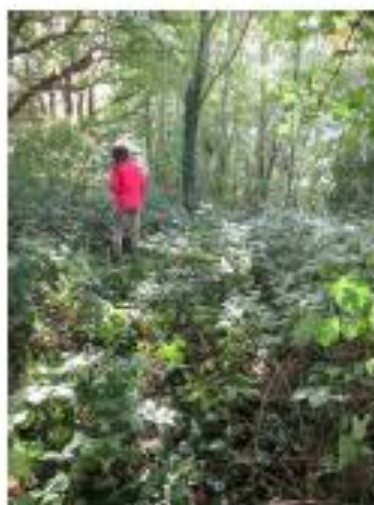
Before starting the work.