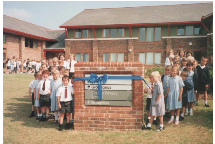
The opening of the present school